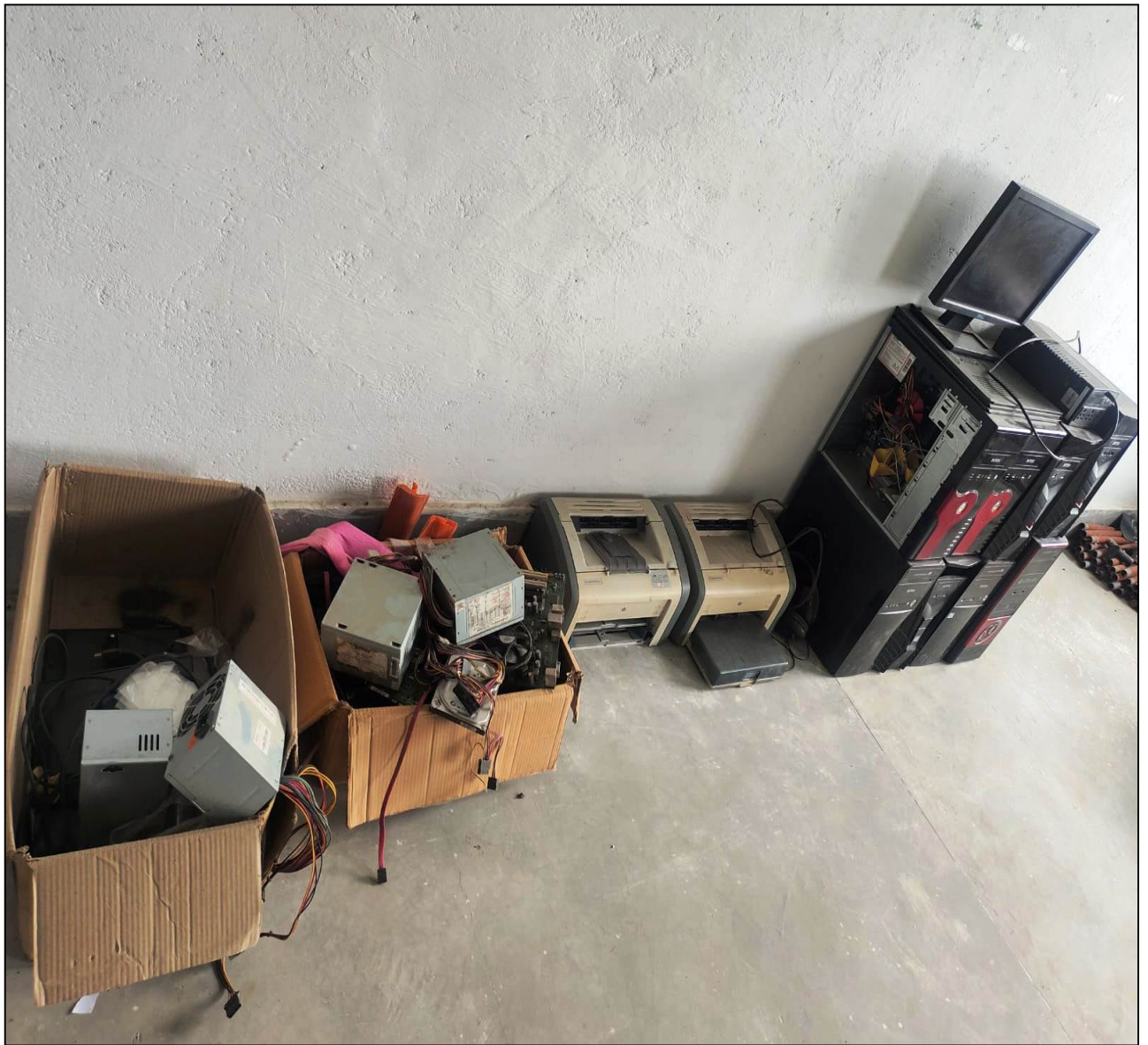
E-waste stored in a particular location in store for exchange offer or dispose off to minimum price.